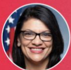
Rep. Rashida Tlaib