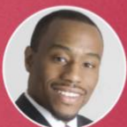
Marc Lamont Hill