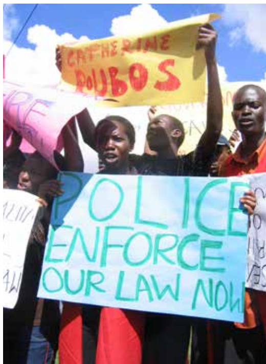
Belize is a hotbed of anti-gay hatred, partly the result of propaganda spread with the help of U.S.-based Christian Right groups.

Though the group's role in Belize is absent from its website, the ADF, like many prominent American religious-right groups, has supported criminalization in the past in this country. In the 2003 Lawrence v. Texas case, the ADF submitted an amicus brief supporting the